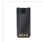
Li-polymer battery 3000mAh