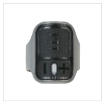
BT wireless ring PTT