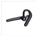
BT Wireless earpiece