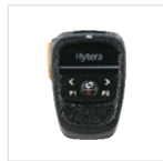
BT Wireless remote speaker microphone