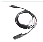
Programming cable (USB port)